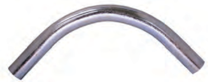
90° CEP EMT Elbow